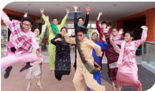
Jubilant YEA members from Singapore Chapter during Taipei CRC 2014

Region 13 experienced a very vibrant, exciting, fulfilling and successful 2014-2015. All chapters in the region conducted many activities that every YEA member focussed. Some of the highlights were that Taiwan Chapter conducted a very successful YEA training event that saw interaction of YEA members from different chapters in the region. Singapore Chapter conducted a string of activities involving unique temple tours, networking and barbeque events, technical meets etc. Hong Kong Chapter conducted a very successful charity event at Orbis: Moonwalker helping the blind along with an art workshop and YEA night. Philippines Chapter conducted a grand YEA night that saw prizes given away for contributions to YEA in Philippines along with YEA talks at universities. The Region also witnessed the 1 st YEA Leadership International event of South East Asia being conducted in Kuala Lumpur during September 2014. The event was a very successful one and helped many YEA members in the region to understand ASHRAE and its activities better. Mitesh Kumar from Singapore Chapter was selected as a Leadership U candidate to attend the ASHRAE conference in Atlanta during June 2015. Dr. Rupesh Iyengar from Singapore chapter was nominated as the top 5 New Face of Engineering candidates by ASHRAE and DiscoverE.