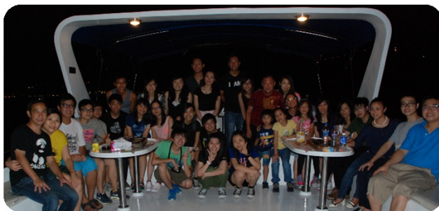
← YEA night conducted at Hong Kong Chapter