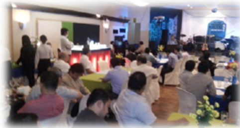
YEA night conducted at Philippines Chapter