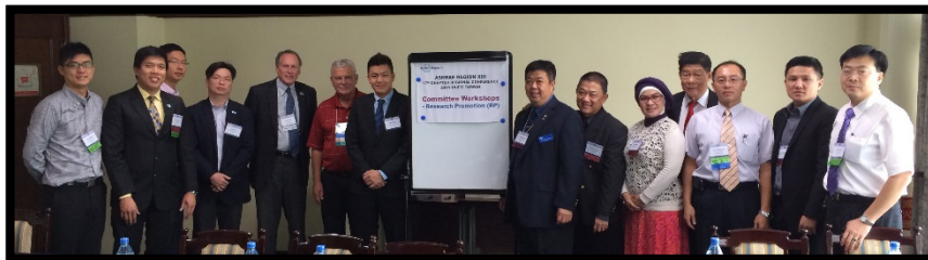
Region XIII RP team

For the Chapters who attained the Chapter Full Circle awards, I hope you will continue to do so for the next fiscal year and set fine examples for your Chapter donors to follow. For those who missed out, my sincere hope that you will try harder to achieve the Chapter Full Circle for the next fiscal year.