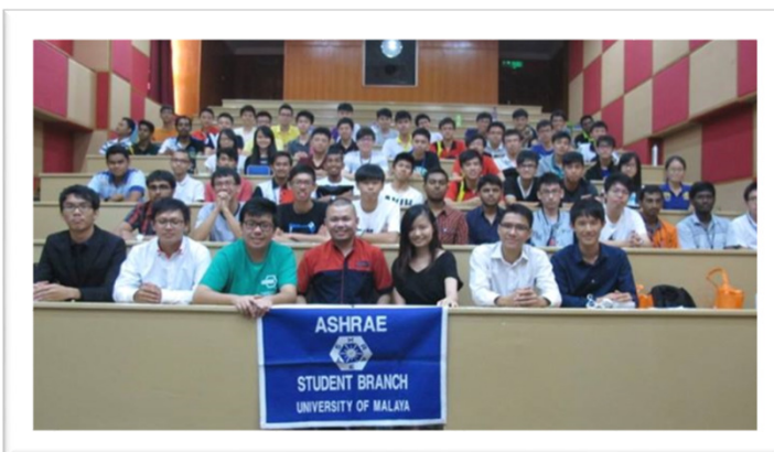
MP introduction during AGM – Taiwan Chapter