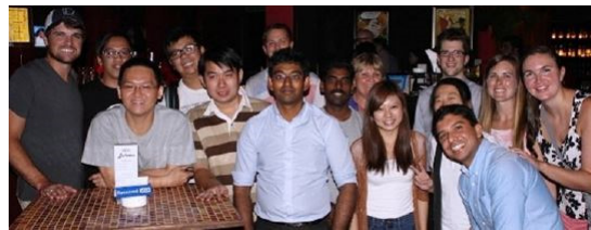
YEA members from Region 13 and ASHRAE mentors at the YEA Leadership International 2014 in Kuala Lumpur, Malaysia