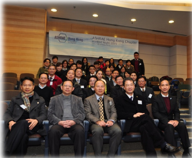
← ASHRAE Night 2015 – Hong Kong Chapter