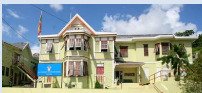
Marryshow House, Grenada