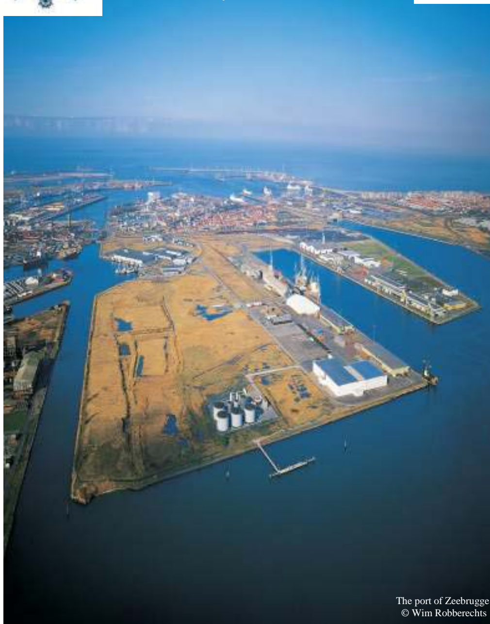
The port of Zeebrugge