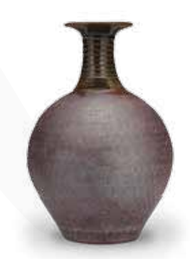
Bottle, 1976-79, by Peter Stichbury