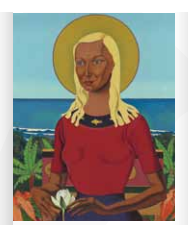
Rutu, 1951, by Rita Angus