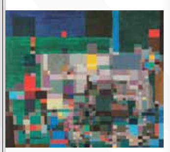
Buildings, 1955, by Milan Mrkusich

Experience New Zealand's rich and diverse artistic heritage. Level 5 is the home of New Zealand's national art collection. Over 300 impressive artworks both historical and contemporary - are showcased in a series of changing long and short-term exhibitions.