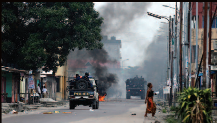
Congolese police drive past a fire barricade during demonstrations in Kinshasa, the capital of the Democratic Republic of Congo, December 20, 2016.

Human Rights Watch calls on President Kabila and other senior officials to end all unlawful and excessive use of force and other forms of repression against protesters, activists, and the political opposition, and to cease all recruitment of M23 fighters to participate in such repression. Congo’s international partners should increase the pressure on Kabila to step down as required by the constitution and support a peaceful transition and credible elections.