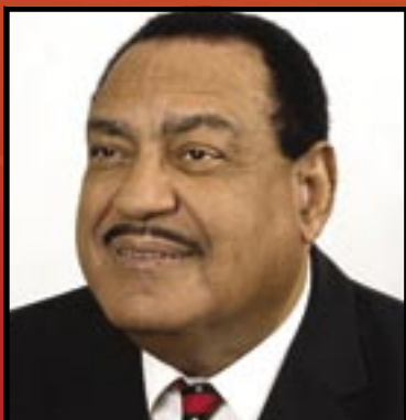
BIRD Lester ST. JOHN'S RURAL EAST