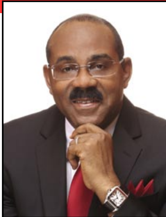
Mr. Gaston Browne Leader of The Antigua & Barbuda Labour Party