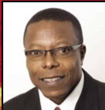
LAKE Eustace "Teco" ST. JOHN'S RURAL SOUTH