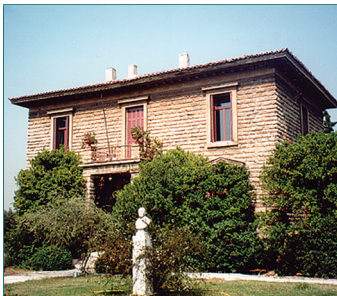
Costas Balaras Athens, Greece