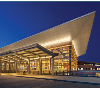
Russell Lavitt Winnipeg, Canada

MTG.EBO will coordinate the activities of multiple TC/TG/TRG and other stakeholders in the area of training and tools to support the operation of buildings to enhance the indoor environment and use energy