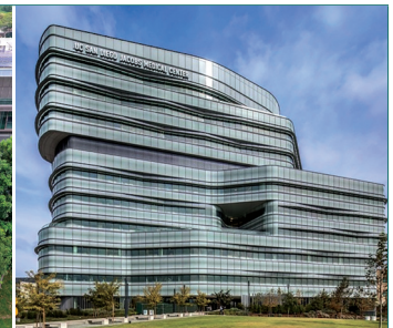
Heather Schopplein San Diego