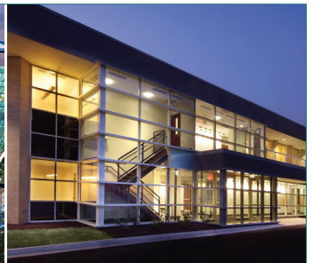
Current ASHRAE HQ Atlanta