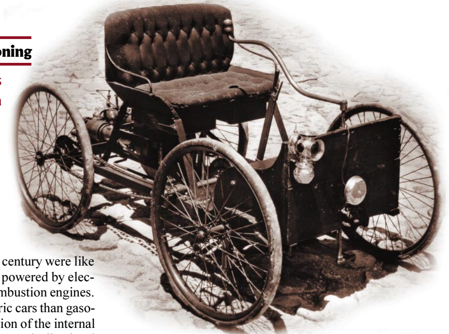
“Horseless Carriages” offered no protection from the elements.

Some electric cars used electric heating pads that were laced into the steering wheel to warm the driver's hands. Heating the steering wheel for a gasoline-burning car was accomplished by bringing in exhaust gas by means of a flexible pipe around the steering wheel. Closed-body automobiles were introduced in 1908. By 1925, production of closed-body automobiles exceeded that of open-body models. Attention turned to heating devices and the need to condition the air for passenger comfort.