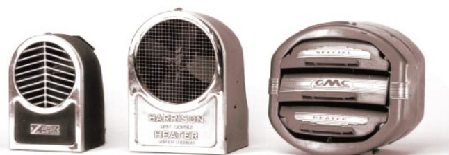
Figure 6: Front views of the hot water heaters manufactured by Harrison Radiator starting 1930.

The heating system controls prior to 1953 were simple because there were no comfort cooling system controls to contend with. With the large-scale introduction of the comfort cooling systems starting in 1953, the heating system controls became intertwined with the comfort cooling system controls. In 1954, Nash Motors announced its new All-Weather Eye , a self-