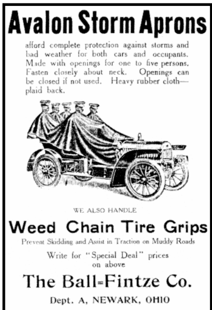
Figure 1: Storm aprons for open-body automobiles. 1, 2

There were numerous problems with these rudimentary heaters. Temperature control was difficult due to a wide variation in the exhaust gas temperature depending on the car speed. Leaks caused some deaths, although no statistics exist on the number of fatalities. Since the early