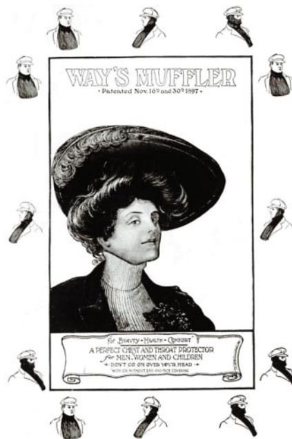
Figure 2a: Lap robe and muffler used in the early days of motoring. 1, 2

MATERIAL —Extra heavy mormie cloth yarn, woven in fancy jacquard pattern. A very beautiful design. COLORS —Olive green, old rose and light brown. Closely woven. SIZE —52x80 inches; weight about 18 ounces.