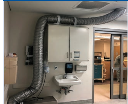
PHOTO 2 Don't use the existing return air duct system for exhaust (Lesson 6).