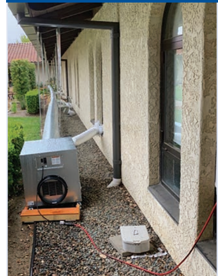
PHOTO 1 Place noisy, portable HEPA exhaust fan units outside, whenever possible (Lesson 2).

dB(A) to 35 dB(A) for patient rooms. Higher sound levels in patient rooms interfere with the healing process and activities of hospital staff.