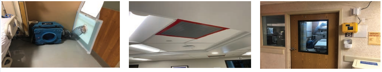
FIGURE 1 Conversion of a typical medical-surgical patient room to a temporary negative pressure patient room. (Left) A typical medical-surgical patient room may be quickly converted to a negative pressure room by placing portable HEPA exhaust fan units that are exhausted through windows directly by or via flexible duct through a fixed window panel. (Center) In this case, the return air grille is sealed. (Right) A digital pressure gage with audible alarm is placed outside the door.

with a compromised immune system from airborne contagions. Due to the recent COVID-19 pandemic, the focus of this article is on negative pressure isolation rooms.