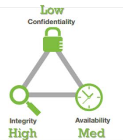
Figure 4. VOLTTRON priorities.

Prioritizing threats is also critical in developing a Threat Profile. With mitigations unique cost, level of effort, and consequences, so it is critical to prioritize. The SSC basis for prioritizing is the standard CIA (Confidentiality, Integrity, and Availability) Triad. Stakeholders must rank Confidentiality (keep the data secret), Integrity (make sure the data is correct), and Availability (make the data available). VOLTTRON’s ranking is show in Figure 4.