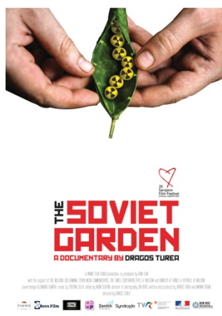
The Soviet Garden (Dragos Turea, Republic of Moldova/Romania, 2019)