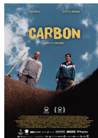
Carbon (Ion Borș, Republic of Moldova/Romania/Spain, 2022)