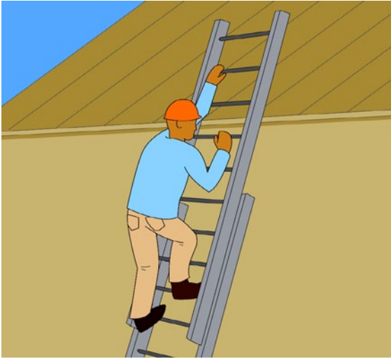
Figure 2: Ladder extending three feet above the landing area.