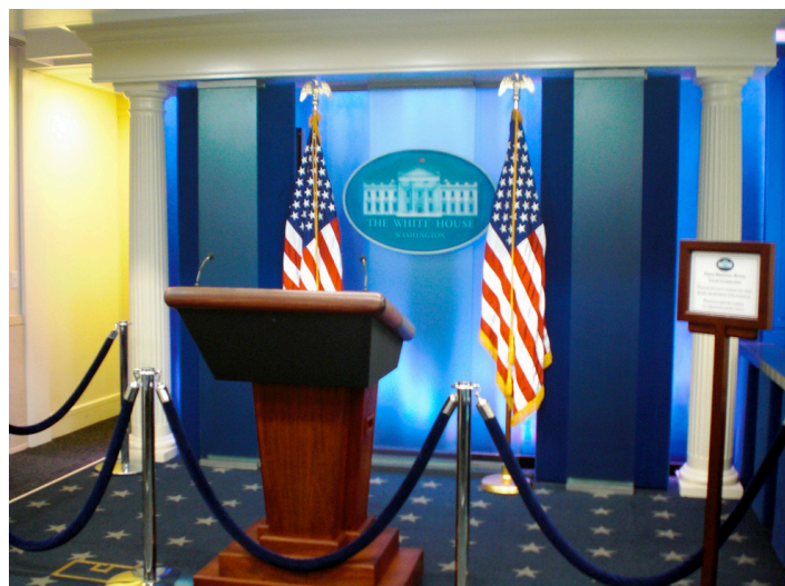
The White House press briefing room.

While the circumstances vary in the remaining cases, there were three instances where government officials prevented reporters from covering protests. Two of these occurred inside the U.S. Capitol: in January, a congressman blocked a journalist from photographing a protest, and in July, a U.S. Capitol police officer ordered a journalist to delete photos and video of protesters that he had filmed in the Senate hallways, implicating the journalist’s Fourth Amendment right to be free from unreasonable