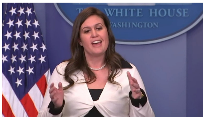
White House Press Secretary Sarah Huckabee Sanders.

Trump tweeted in December that ABC News should fire Brian Ross, who incorrectly reported that Trump directed then-campaign advisor Michael Flynn to reach out to the Russian government while Trump was a candidate, when this actually occurred after Trump had been elected. ABC News corrected