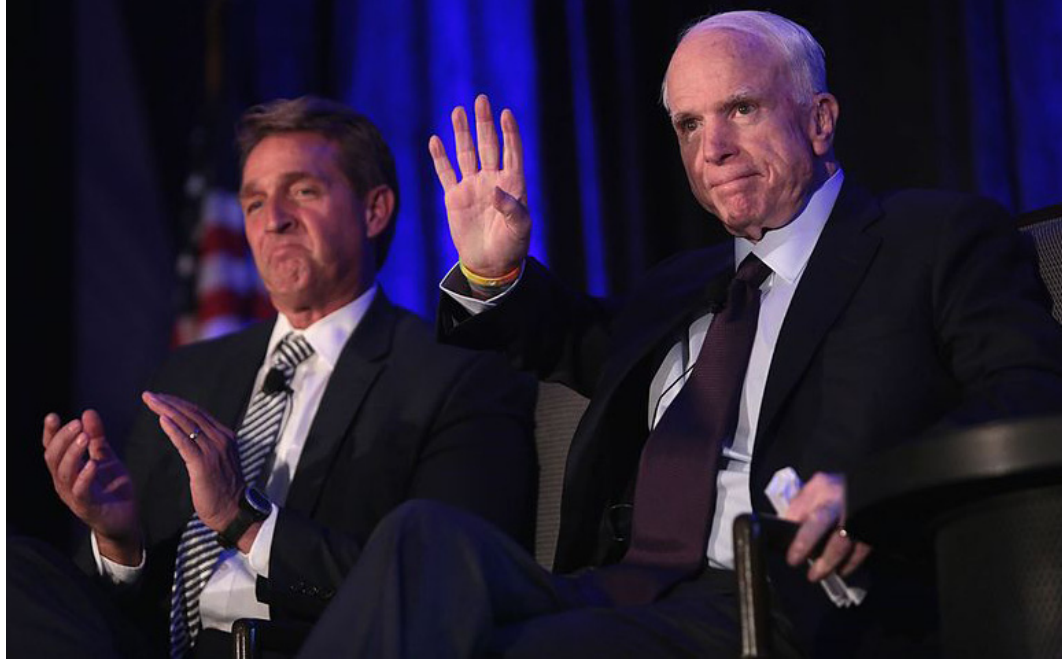
Sens. Jeff Flake, left, and John McCain are among those who have defended the press.

On the other hand, Sens. Jeff Flake (R-Ariz.) and John McCain (R-Ariz.) are among those who have defended the press and criticized Trump for his attacks on the news media and truth, more generally. On the same day in January 2018 that Trump announced his "Fake News Awards," Flake gave a speech on the Senate floor, blasting the president for an "unrelenting daily assault on the constitutionally protected free press," calling it "as unprecedented as it is unwarranted." 52 He condemned Trump's practice of calling the press "the enemy of the people," noting that it is a term Joseph Stalin infamously used to